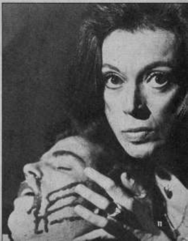
Carlotta (Grayson Hall) isn't afraid of getting her fingers bloodied as she holds her nephew's head.