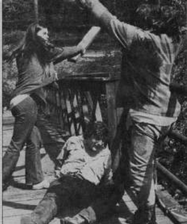
Tracy gets into a fight between Gerard & Quentin and knocks Gerard off the railing of a bridge.

After several months of a plot featuring sinister,