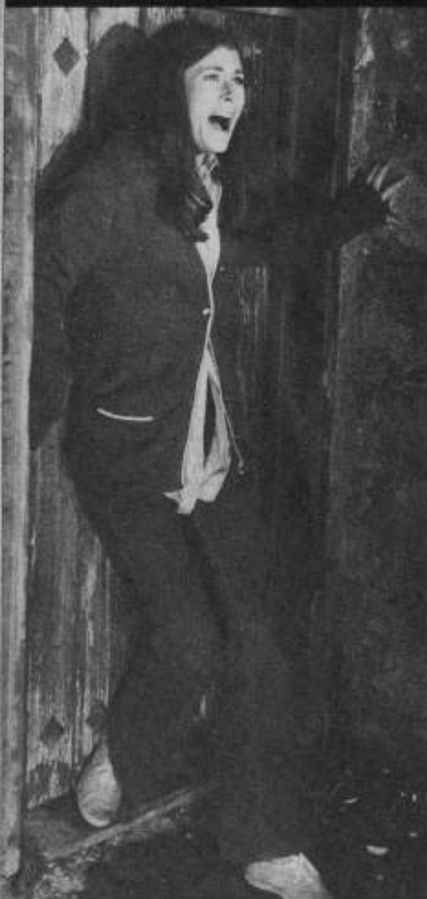
What she (Kate Jackson) sees is enough to drive her crazy!

tower room. The first night, Quentin is mesmerically drawn to the room. Inexplicably, the next morning he remembers nothing of his nocturnal adventure.