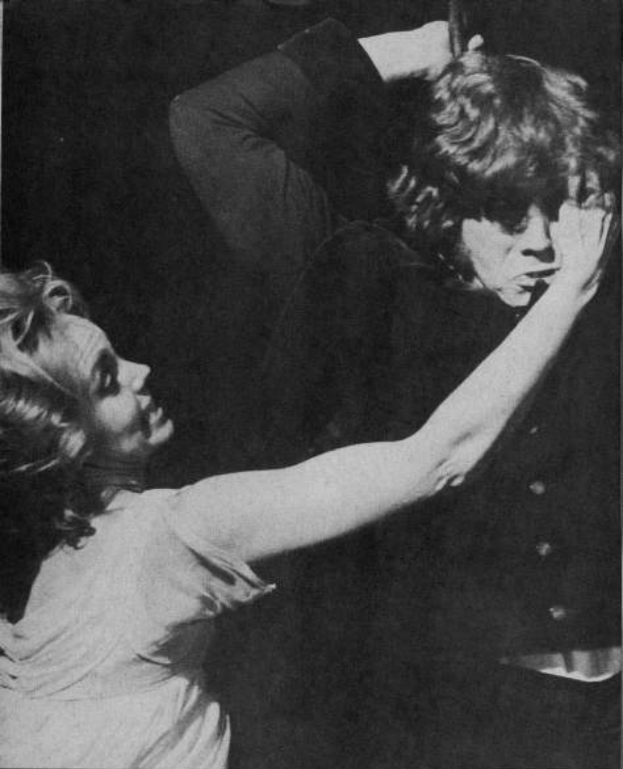
Doomed to be hanged, Angelique (Lara Parker) will be hanged if she doesn't try first to prevent her husband from killing Charles Collins.